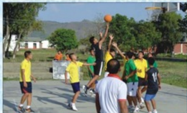
Inter-House Basketball (Jr) final match between Shivaji House and Netaji House in progress