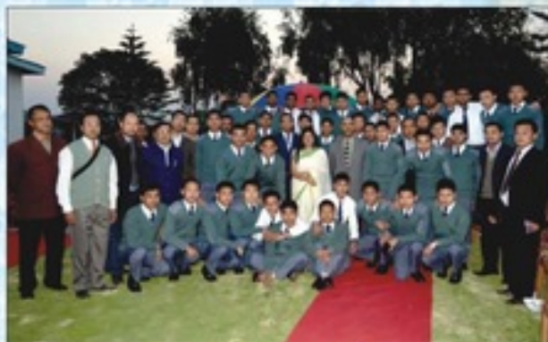
Class XII cadets and staff at Sainik House

A get-together tea party was organised at Sainik House on 15 th February 2013 which was attended by officers, staff and cadets of class XII. In an interactive session of the function, various aspects