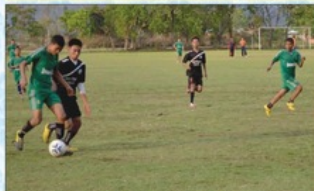
Inter-House Football final match between Netaji House and Raman House in progress