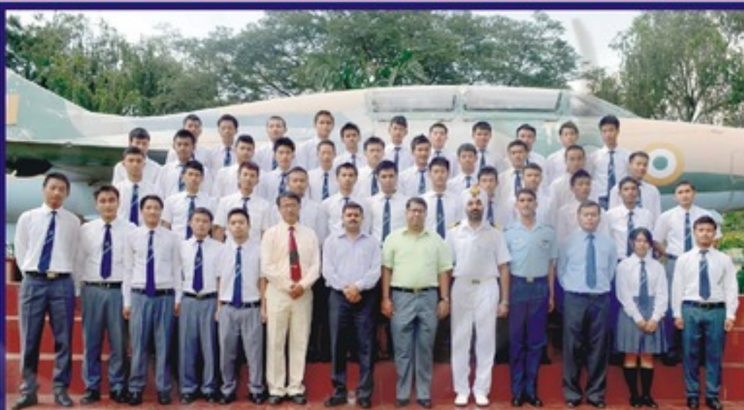
The visiting dignitaries from the Ministry of Defence along with Headmaster, Registrar, Senior Master, staff and cadets