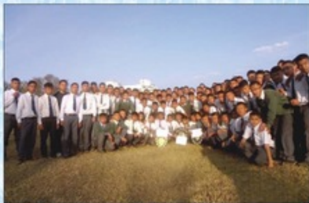
The School contingents, A and B categories which participated in the RD Parade at 1 st MR Ground, Imphal

at 1 st MR Ground, Imphal. The School Contingents, A and B bagged first and second position respectively while the school Band was adjudged third among all contingents from the State.