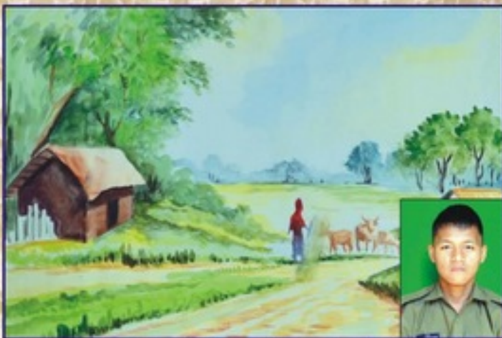
Adm No 3236, Cdt Phantungan Khulang, Class IX-C