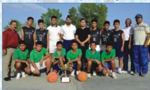
Netaji House Champion in Inter-House Basketball Championship 2013-14 (Jr)