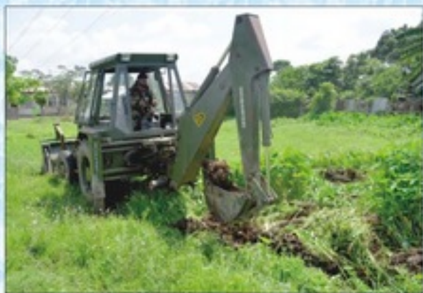
Digging of Drains in progress at the campus