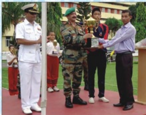
Sainik School Imphal Champion in the East Zone Football Championship 2013 (Junior)

East Zone to participate in the Inter Zonal Sainik Schools Football Championship to be held at Sainik School Kunjpura in August 2013.