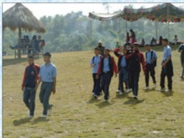
Cadets of Tagore House during their picnic at Andro on 13 th January 2013