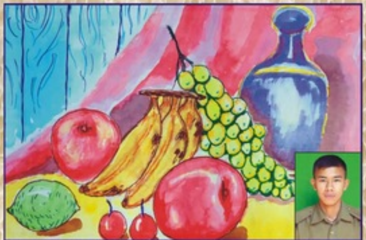
Adm No 3360, Cdt Prabin Hemam, Class VIII-B