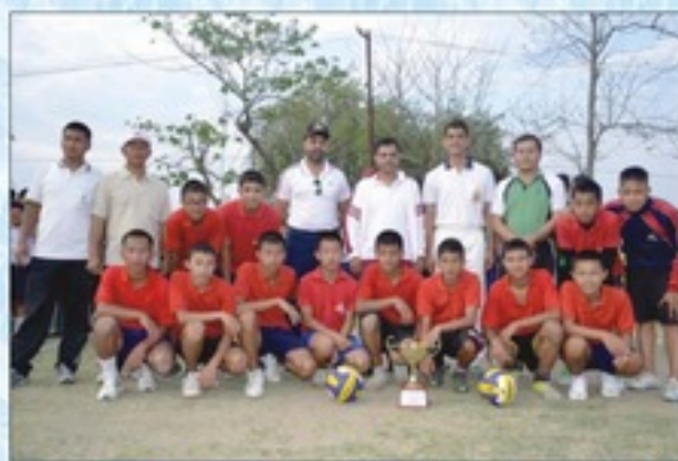
Raman House Champion in Inter-House Volleyball Championship 2013-14 (Jr)