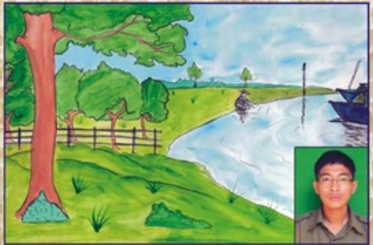
Adm No 3209, Cdt L Pradipkumar, Class IX-B