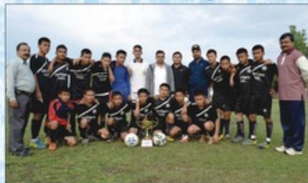
Netaji House Champion in Inter-House Football Championship 2013-14 (Jr)