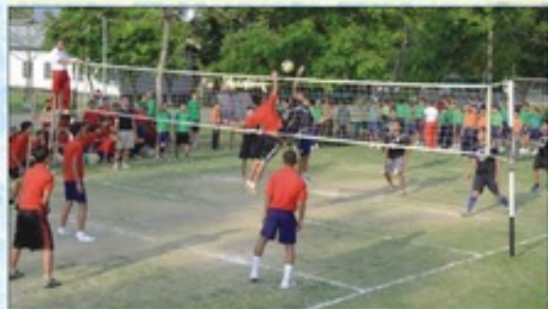
Inter-House Volleyball (Jr) final match between Netaji House and Raman House in progress