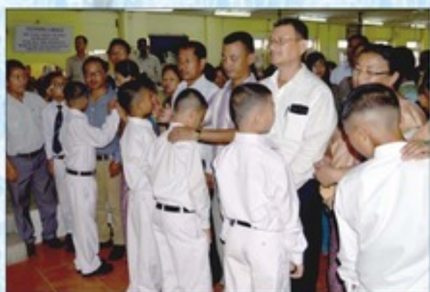
'Blessing Ceremony' of newly joined class VI cadets at Cadets' Mess on 18 th June 2103

For the academic session 2013-14, the new class VI cadets came to the school on 18 th June 2013. Special arrangement was made for these cadets during summer vacation with an aim to acquaint them with the school routine activities. On the occasion, a grand lunch was organised for the parents in the Cadets' Mess. It was followed by a "Blessing Ceremony" in which the parents blessed their wards for their stay at the school.