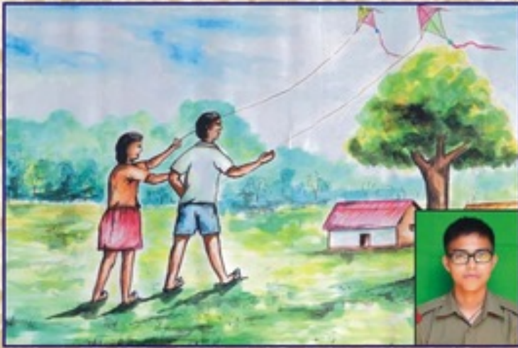
Adm No 3322, Cdt Divyam Hanjabam Class VIII-B